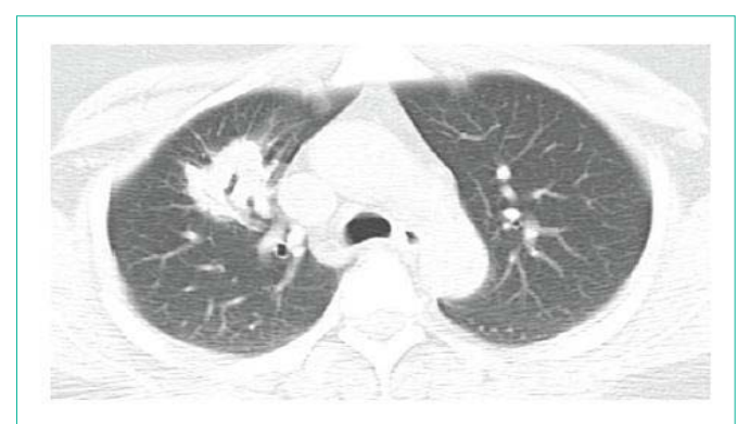
Figure 1: Initial CT of the chest with contrast - 3cm lesion in right upper lobe, which is suspicious for neoplastic lesion.