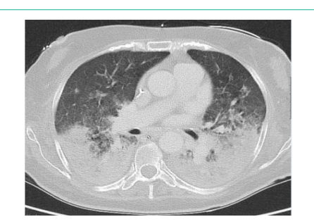
Figure 1: Contrast-enhanced thorax CT scan demonstrates diffuse bilateral infiltrates involving >50% of lung parenchyma with dorsal consolidation areas.