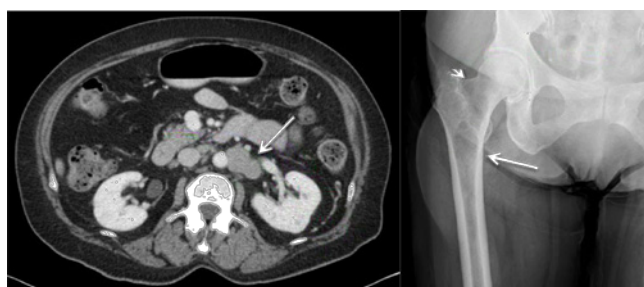
Figure 1: (Left) Computed tomography with contrast of the abdomen demonstrated periaortic adenopathy measuring up to 4.9 cm (arrow). (Right) Two lytic lesions (arrows) identified on magnetic resonance imaging in the right proximal femur.

six due to lung toxicity. Treatment for consisted of 20 mg of dexamethasone weekly and 4 mg zoledronic acid injections every 4 weeks while she received ABVD chemotherapy. She subsequently demonstrated regression of her lymphadenopathy with a Deauville criteria of one on the final PET-CT, but the bone lesions remained hypermetabolic. Biopsy of the sacral bone lesion confirmed active MM. Electrophoresis showed reduction in the IgG Kappa M protein spike (from 0.5 to 0.1 mg/dL) and reduction of the kappa/lambda free light chain ratio after treatment of HL with ABVD and weekly dexamethasone. Treatment for MM was initiated after completion of ABVD, with weekly bortezomib subcutaneous injections and oral dexamethasone for a total of 16 cycles. She was evaluated for autologous bone marrow transplant but deemed not to be a suitable candidate due to her comorbidities. The patient has been followed without progression of disease for over two years.