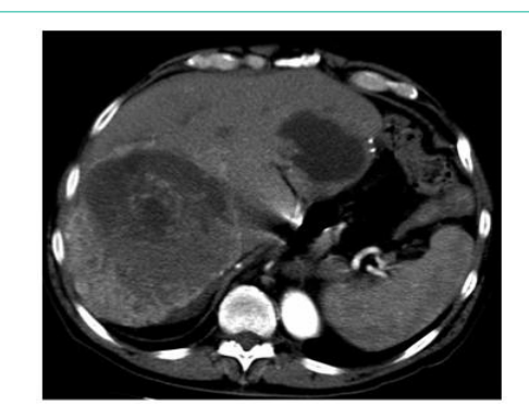
Figure 3: Recent surveillance imaging demonstrating reduction in size and internal necrosis of large right hepatic metastasis and a peripheral left liver metastasis.

Multimodal imaging allows for optimal visualization and more accurate diagnosis of these lesions and is particularly useful when evaluating metastatic disease. Ultrasound reveals a hypoechoic lesion, which becomes hyperechoic during the arterial phase of contrast administration due to the marked vascularity of HPC. On contrast