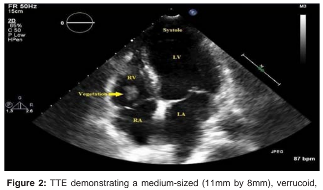
Figure 2: ITE demonstrating a medium-sized (11mm by 8mm), verrucoid, solid, fixed vegetation on the tip of the posterior tricuspid valve leaflet, during systole.

state and failure to meet the modified Duke criteria, infectious endocarditis was deemed unlikely and a diagnosis of NBTE was strongly considered, presumptively with bilateral heart involvement despite confirmation of involvement only within the right heart. A bubble study during TTE was not performed. With input from the neurology service, the patient's therapeutic anticoagulation was transitioned from rivaroxaban to enoxaparin. Following this change, no further neurological deficits developed, and the patient had fair performance on both physical therapy assessments and speech/ swallow testing. Unfortunately, her neurological deficits did not improve, and her performance status precluded further treatment of her advanced pancreatic malignancy. She was ultimately discharged home with hospice services.