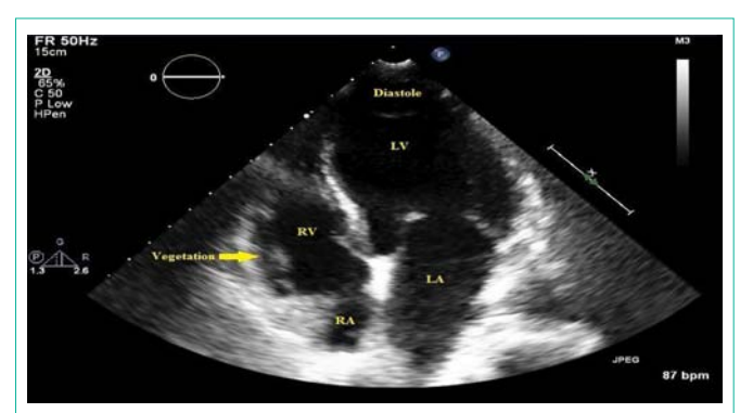
Figure 3: TTE demonstrating a medium-sized (11mm by 8mm), verrucoid, solid, fixed vegetation on the tip of the posterior tricuspid valve leaflet, during diastole.

This case report describes a patient with a recently diagnosed metastatic pancreatic adenocarcinoma presenting with evolving ischemic cerebral infarctions secondary to suspected nonbacterial thrombotic endocarditis (NBTE). NBTE is an uncommon hypercoagulable condition, which results in the development of sterile vegetations on the heart valves. This noninfectious pathology is most commonly associated with advanced visceral malignancies and systemic inflammatory processes such as systemic lupus erythematosus (SLE) and disseminated intravascular coagulation (DIC) [1-3]. The association between malignancy and thromboembolic phenomena is particularly well-known, first described by Trousseau in 1865, when he characterized migratory superficial thrombophlebitis [4]. Later