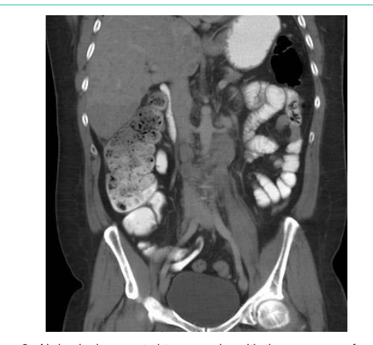
Figure 3: Abdominal computed tomography with the presence of remanent retroperitoneal lymphadenopathy.

PET-CT scan presented hyper metabolic activity of cervical, mediastinal and retroperitoneal lymphadenopathy. Aspiration and bone marrow biopsy were negative for lymphoma infiltration. Serum protein immune electrophoresis exhibited high levels of IgG (2525 mg/dl). Normal Inmunofixation pattern was observed.