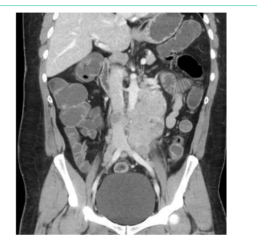
Figure 2: Abdominal computed tomography with an important retroperitoneal lymphadenopathy.

Figure 1D: Immunohistochemistry a plasmablastic lymphoma.