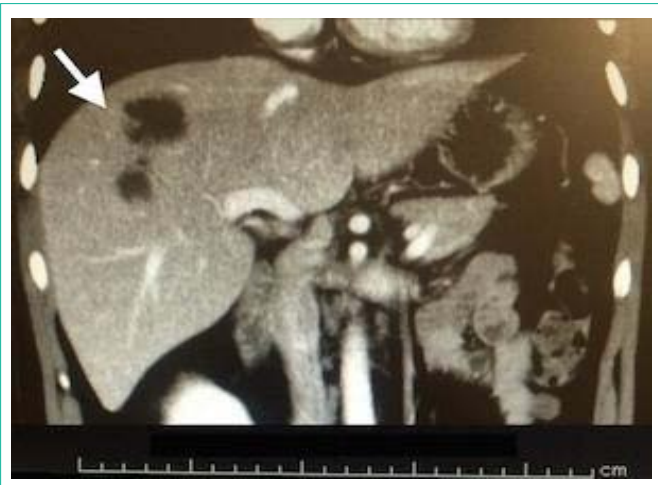
Figure 1: Computed tomography demonstrated liver abscesses (arrow).

His laboratory test results were significant for pancytopenia and elevated liver enzymes: white blood cell count: 2,100/\mu L with a normal differential; hemoglobin: 11.9~g/dL; platelet count: 8.3\times104/\mu L ; aminotransferase: 235~IU/L; alanine aminotransferase: 144~IU/L; lactate dehydrogenase: 1,272~mg/dL; alkaline phosphatase: 617~IU/L; and \gamma -glutamyltranspeptidase: 248~IU/L. Ferritin level was 88,774~ng/mL (normal range: 20-220~ng/mL), and soluble interleukin-2 receptor was 721~U/mL (normal range: 145-519~U/mL). Multiple cultures of blood, urine, and sputum were negative for bacteria, mycobacteria,