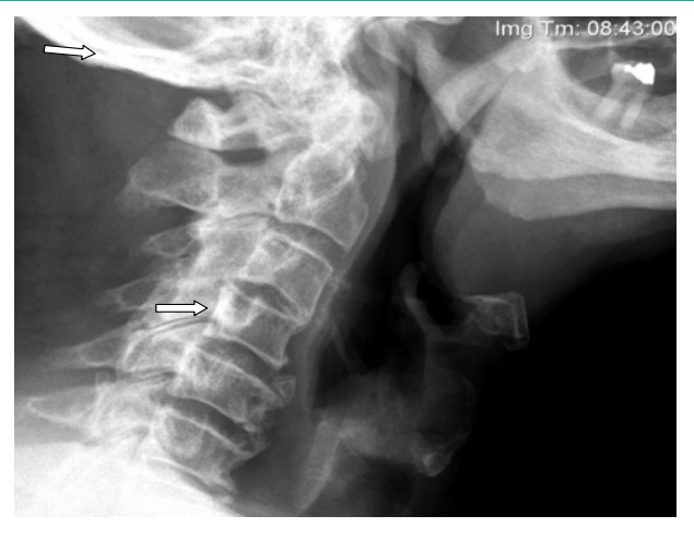
Figure 1: Plain film of the skull and cervical spine showing sclerotic lesions (see arrows).

cervical and left axillary lymphadenopathy, diminished breath sounds with percussion dullness at the lung bases, and bilateral lower extremity edema. Abdomen was soft and without organomegaly. The patient was wheelchair bound due to an areflexic, grade 4/5 lower extremity weakness. Computed Tomography (CT) scan showed bilateral pleural effusions as well as extensive sclerotic lesions in the thoracolumbar spine, ribs, and pelvis. The results of a technetium bone scan were normal but a metastatic skeletal survey showed diffuse osteosclerosis in the skull and vertebral bodies (Figure 1).