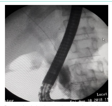
Figure 4: Retrograde cholangiogram demonstrating horizontal band like filling defect in distal CBD.

The physiologic implications of web of the extrahepatic biliary tree are not necessarily the same as for other causes of extrahepatic biliary obstruction. While the web may ultimately cause obstruction, it is likely that forward drainage from the liver will be undisturbed in the vast majority of cases. Initially the patient may be asymptomatic or may present with vague and nonspecific symptoms such as abdominal pain, nausea and vomiting. Early on in the disease process, one may only demonstrate elevations of transaminases and alkaline phosphatase, together with ductal dilatation, but without obstructive jaundice. However, in the setting of inflammation in the region of the porta hepatis, or the passage of a small calculus, the web will almost certainly become obstructed and result in obstructive jaundice with or without the association of cholangitis. These webs are probably congenital and only present later in life due to an associated abnormality.