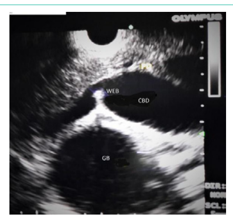
Figure 3: EUS demonstrating hyperechoic structure "web" in distal CBD with proximal CBD dilatation.

Webs may be partial or complete and the degree of obstruction determines whether patient will be symptomatic or not. Treatment is either Endoscopic dilatation or surgical by-pass [2]. Dolar et al. described a congenital web of the CHD in an adult patient, which was not associated with jaundice [3]. Chapoy et al. described a similar case to the one described by Dolar et al. but their patient was only 40 months old.4 The association of CHD 'diaphragms' and biliary obstruction has been described by both Fisher et al. and Devanesan et al., who postulated that small perforations in these diaphragms allowed some degree of biliary drainage and thus a delayed presentation of obstructive jaundice [5,6]. Ravi K et al. In their report mentioned about successful endoscopic therapy of choledochal web by Balloon Dilatation [7]. Kim et al described a case of intra-hepatic choledochal web which was treated by balloon dilatation [8]. Gulliver et al. described common bile stones to be associated with the web in a significant number of patients [9]. Our patient did not, however, have bile duct stones, but clearly had a web present in the CBD and had significant improvement in clinical and biochemical parameters post endoscopic treatment.