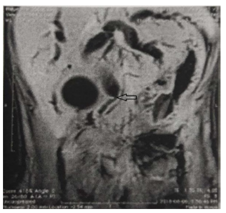
Figure 2: T1 MRI demonstrating hyperintense lesion in distal CBD causing proximally dilated CBD.

idiopathic. Our case represents the first to report EUS characteristics of choledochal web, with no previous reports till date.