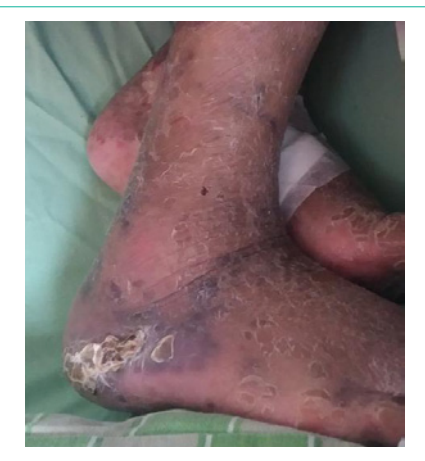
Figure 1: Purple and brown lesions on his lower extremities, performed biopsy 1 year previously.