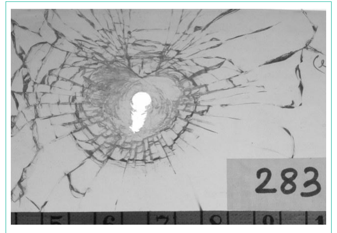
Figure 1: 8 mm bullet entry hole on glass sheet.

No studies were reported on fracture of sun control coated thin film window pane in forensic point of view. In this paper attempts were made to analyse the fracture of glass of sun control coated thin film windowpane as target fired by .315 rifles, 303 rifle, AK47 rifle, 9mm pistol and an improvised pistol using their respective ammunitions and compared their result for collaborative analysis. This study will help forensic examiners ascertain the nature of glass fragmented.