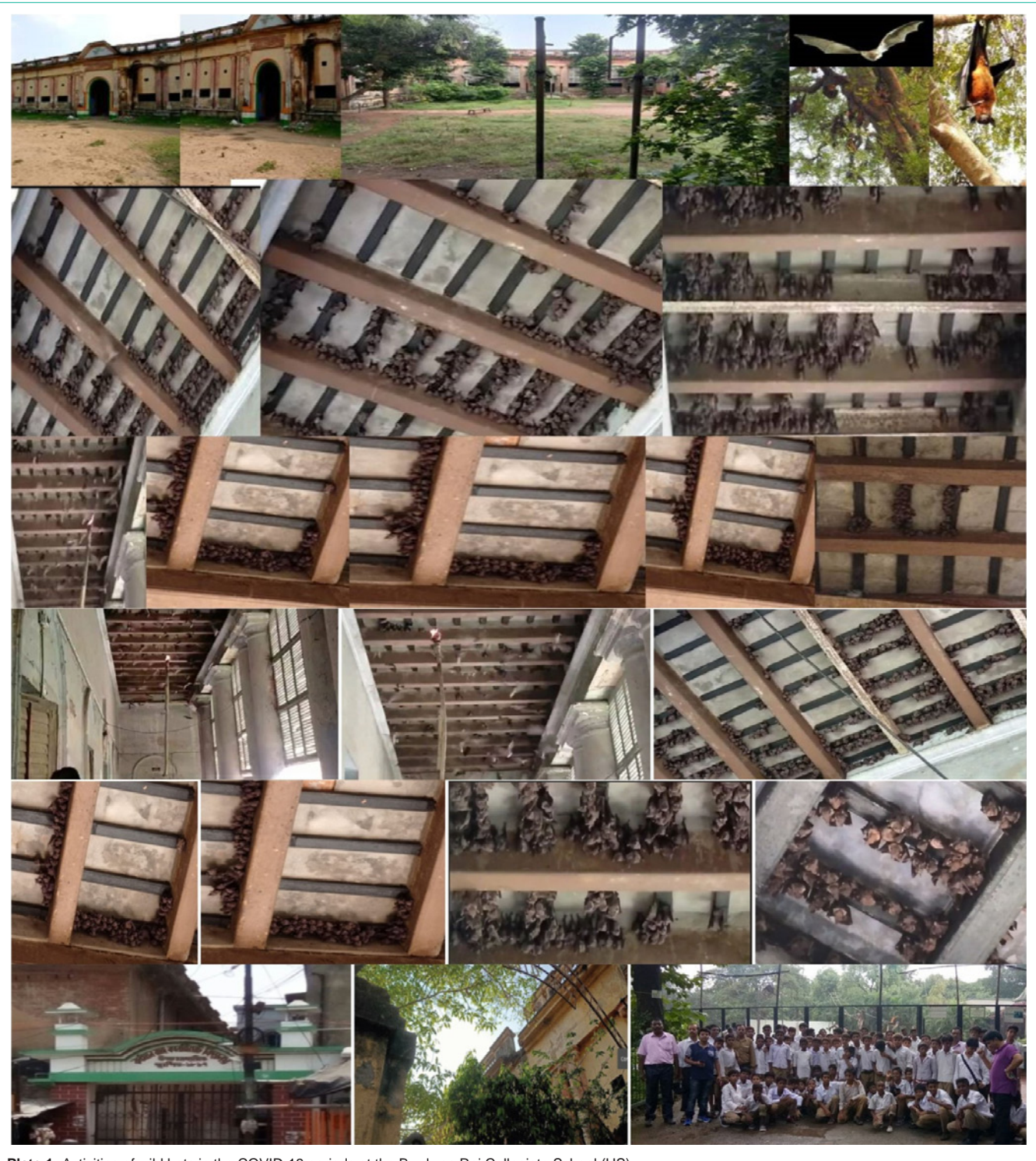
Plate 1: Activities of wild bats in the COVID-19 periods at the Burdwan Raj Collegiate School (HS).

thrice or more. All the data were counted for statistical analysis by the Analysis of Variance (ANOVA) [10,11,36-39].