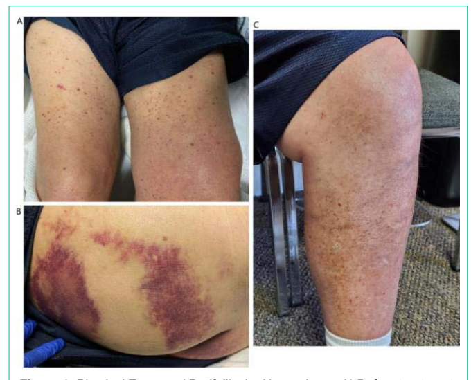
Figure 1: Physical Exam and Perifollicular Hemorrhage. A) Before treatment: Petechiae on thighs. B) Before treatment: Ecchymoses on buttocks. C) After two week's treatment: Lower extremities.

violaceous purpuric indurated patches over the bilateral upper and lower extremities, buttocks, and lower abdomen (Figure 1A and 1B). Corkscrew hairs were noted on the bilateral lower extremities (Figure 2A). The lower extremities were swollen bilaterally. There was no