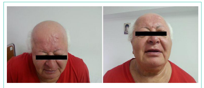
Figure 1: Clinical appearance of the patient showing severe signs of androgen excess.