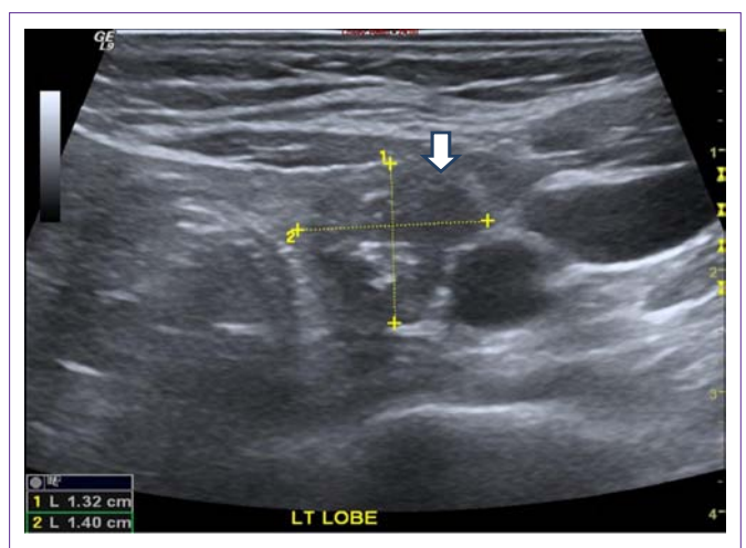
Figure 2: Ultrasonographic image of a 56-year-old woman with a non-homogenous hypo-echoic solid papillary thyroid carcinoma (white arrow) with poorly-defined margins and irregular, lobulated contours.

with specificity of 100%, sensitivity of 41.17%, positive predictive value of 100% and negative predictive value of 66.66% (P<0.001).