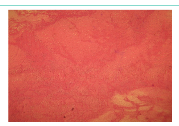
Figure 2: Pathological exam demonstrated the macro adenoma necrosis with bleeding

No more case of pituitary adenoma bleeding after OPCAB cardiac surgery has been reported so far and all remaining 11 cases of apoplexy were reported with on pump CABG [5]. Our case is a rare case report of pituitary adenoma apoplexy that occurred after OPCAB. The frequency of apoplexy after CPB is related to its effect on body organ system. CPB with its side effect on coagulation system may be associated with more neurologic complication than the operation which performed by OPCAB. Pituitary adenomas have an incidence of %10 between intracranial neoplasm with an overall annual incidence of 16 per million per year [6]. The prevalence of occult adenomas is unknown, but symptomatic adenoma has an incidence up to 9 per 10,000. Adenoma may slowly enlarge over years and can lead to morbidity by compressing effect on neighboring structures, such as cranial nerve or pituitary hormone over secretion. Patients may have headaches, visual defects, and cranial nerve palsy from the compressive effects on Para-cellular structures [7]. Much of these adenomas are silent and may be present itself due to trauma, surgery or spontaneously and became hemorrhagic. However, pituitary adenoma apoplexy is a benign syndrome. In other hand an extension of bleeding may be associated with life-treating such as coma. Spontaneously adenoma hemorrhage is a rare phenomenon, but the wide variety of medical interventions with anticoagulation