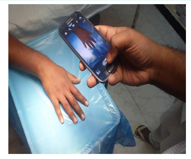
Figure 2: Smart phone being utilized to obtain clinical photographs.