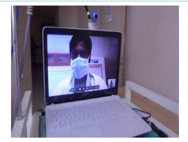
Figure 4: Consultant giving tele- emergency consultation.

path, especially, where there are a limited number of board-certified specialty care givers. It is user friendly, cost effective helps in early initiation of treatment, and frequent interaction and updates with consultants and experts.