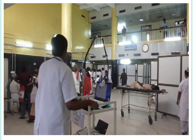
Figure 1: Tele-Emergency console in emergency department.

Austin J Emergency & Crit Care Med - Volume 3 Issue 2 - 2016 ISSN : 2380-0879 | www.austinpublishinggroup.com Chittoria et al. © All rights are reserved