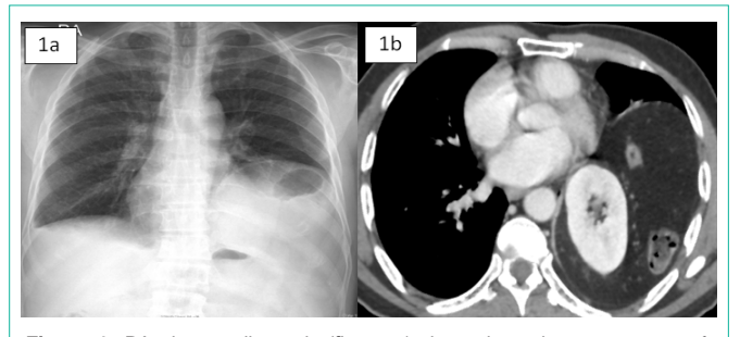
Figure 1: PA chest radiograph ( figure a ) shows large homogeneous soft tissue lesion with air locule in the left lower hemithorax silhouetting the left hemidiaphragm and causing mild contralateral mediastinal shift. Axial contrast CT of thorax ( figure b ) shows left kidney, splenic flexure of colon and omentum in left hemithorax up to level of heart.

Bochdalek hernia is a congenital posterior lateral diaphragmatic defect that allows abdominal viscera to herniate into the thorax. The incidence of intra-thoracic kidney with Bochdalek hernia is less than 0.25% [1]. There exists either an abnormality in the pleuroperitoneal membrane fusion or high migration of the kidney due to delayed mesonephric involution [2].