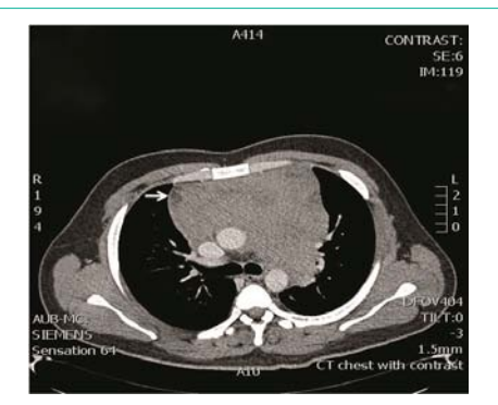
Figure 3: Chest CT showing a large heterogeneous mass involving the superior and anterior mediastinum, measuring approximately 11.8 x 4.4 x 4.8 cm

Figure 2: CXR showing cardiomegaly and left lower lobe consolidation.