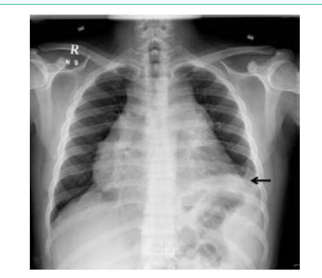
Figure 2: CXR showing cardiomegaly and left lower lobe consolidation.