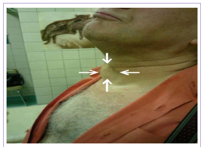
Figure 1: Case 1, input clinical findings.