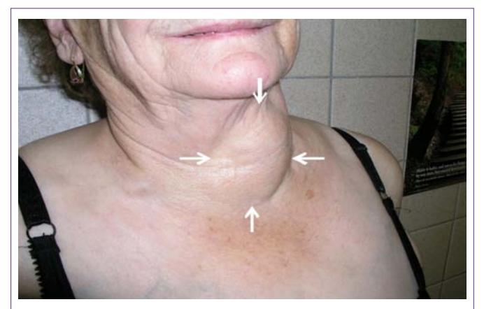
Figure 3: Case 2, input clinical findings.

The largest and most successful studies were those with patients treated for recurrent thyroid cysts. The reported studies mostly comprised tens or even hundreds of patients, such as those by Del Prate et al. (98 patients), Kim YJ et al. (127 patients) or Lee and Ahn (432 patients) [10,12,13]. The approach was found to be highly effective. In the vast majority of cases, the cysts volume was reduced (to less than 50% of the initial volume) or the fluid component even disappeared completely, both of which are considered a therapeutic success [7]. The outcome is affected by the initial cyst volume and character of the fluid component [14]. The method was compared