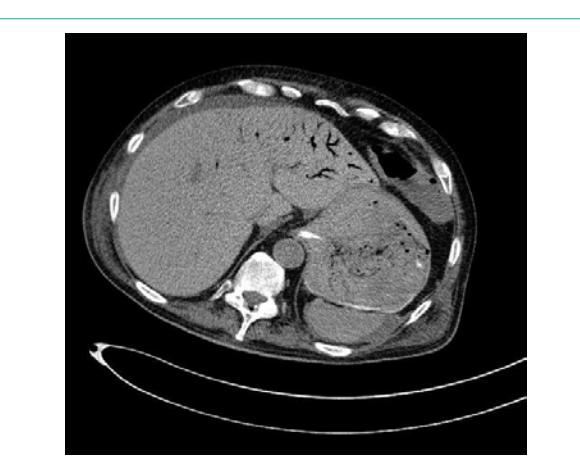
Figure 1: An extended non-occlusive mesenteric ischemia with hepatic portal venous gas and pneumatosis intestinalis was diagnosed.