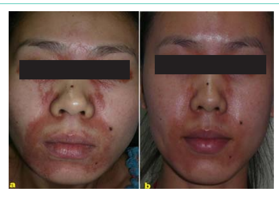
Figure 1: CGPD in adult before '(a)' and after '(b)' treatment: '(a)'A close up view shows papules on the red base around the mouth, the side of the nose and around the eyes. View '(b)' shows dramatic improvement following ten weeks treatment.

Perioral dermatitis is a well-recognized Papulopustular facial