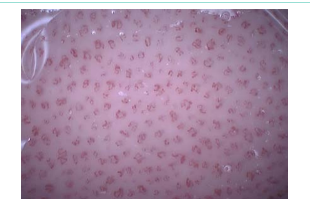
Figure 2: Video dermatoscopy of a psoriatic plaque: dilated, elongated, "bushy" capillaries, homogeneously distributed throughout the entire lesion (X100).

VD appears to be a valid non-invasive aid in the diagnosis of psoriasis, particularly in cases where the clinical presentation is doubtful. This was demonstrated in hand, scalp and genital psoriasis, in which cases clinical diagnosis may sometimes be troublesome. In a study conducted on 32 patients with palmar and/or plantar erythematous scaly lesions, VD examination at X200 revealed a "bushy" aspect in 15 cases. This indicated a diagnosis of psoriasis which was later confirmed by histopathology. In the remaining 17 cases, in which there was no evidence of "bushy" capillaries, the histopathologic diagnosis was of spongiotic dermatitis [20]. Another study conducted on 90 subjects compared with one another capillary morphology in psoriasis, seborrheic dermatitis and normal skin of the scalp. Scalp psoriasis exhibited a "bushy" pattern, with a 73 +/-17 µm diameter of capillary bushes. In contrast, scalp seborrheic dermatitis presented a multiform pattern, with mildly tortuous capillary loops and isolated dilated capillaries, but a substantial preservation of the local microangioarchitecture. The mean diameter of the capillary bushes was significantly lower (27 + -4 \mu m; p < 0.001) and similar to that of the scalp of healthy subjects (21 +/- 5 \mu m). The capillary loop density was similar among patients with psoriasis, seborrheic dermatitis, and healthy scalp skin (21). Genital psoriasis often represents a clinical dilemma especially in those cases in which