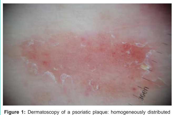
dotted vessels over a light red background associated with diffuse white scales (X10).

"red dots" (Figure 1). These dots represent the view from the top of the tortuous, ecstatic and elongated capillaries within the elongated dermal papillae [10].