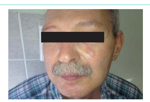
Figure 1c: Lesion regressed after cryotherapy treatment.

Melanoacanthoma is a solitary benign skin tumor that is common with middle- old aged people and is usually placed on the head, trunk, lips or eyelids. Melanoacanthoma can imitate the clinical presentations of seborrheic keratosis and malign melanoma. But characteristic histopathological attributes allow differentiation of these 3 diseases. Recently, melanoacanthoma is thought to a rare variant of seborrheic keratosis rather than a distinct entity. Melanoacanthoma is a benign skin tumor, so it can be treated with curettage, cryotherapy or simple excision.