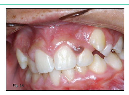
Figure 1A: Clinical pictures: a brown rounded papule (seemingly harmless) is shown on the gingival papilla. Multiple ephelis spots can be seen scattered on skin area of the lip.

the cases)in Caucasian individuals aging 40 years old or older [4,5]. Lesions are small, usually measuring less than 1 cm in diameter, ranging from brown to deep black in color. Melanotic lesions are harmless – excisional biopsy is only indicated as to differentiate it from melanoma and (most frequently) for cosmetic reason. Histopathology shows normal number and morphology of melanocytes and increase amount of melanin [1].