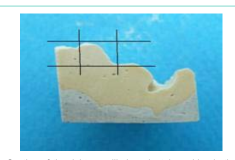
\textbf{Figure 9:} \ \ \textbf{Section of the right mandibular edentulous ridge in the middle of the protuberance.}

The cephalometric evaluation with the old restorations in the mouth reveal an almost hypodivergent skeletal pattern (FMA=21), with an increased facial index (FI=0.8), which suggests an anterior rotation of the mandible. Other measurements also support the diagnosis of reduced vertical dimension and anterior rotation of the mandible: GoGn – SN (30 as compared to a normal value of 32), NsaNsp-M (17, normally 28), NsaXi-XiPM (36, normally 43), NsaMe. Angular measurements show a normal position of the maxilla and mandible in relation to the cranial base.