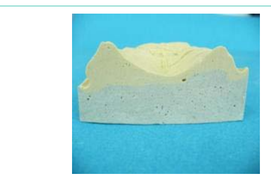
Figure 12: Posterior right side undercut level.

(SNA=81, SNB=78). ANB angle indicates a relatively normal skeletal relationship between the maxilla and mandible (ANB= +3). However, using McNamara analysis, a prognathic position of the mandible could be determined. (Pg is located anteriorly of N FH) and a lower lip prominence (LI-E line has a positive value) (Figure 6, 7). The mandibular master cast revealed the protuberance in the right buccal sulcus. The right side of the residual ridge is significantly smaller than the left ridge (Figure 8, 9). The master casts were duplicated and sectioned for a better evaluation. The sections better reveal the protuberance's dimensions (Figure 9, 10).