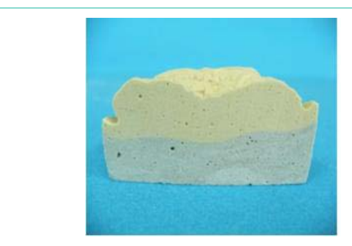
Figure 11: Right side undercut at canine.