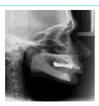
Figure 6: Lateral cephalometric radiograph.

The mandibular alveolar crest presented an increased resorbtion in the areas related to the opposing teeth, when the vertical position of the mental foramen and mandibular canal were taken as reference. In the alveolar area corresponding to teeth 46 and 47 a bone condensation and a protuberance is visible (Figure 5).