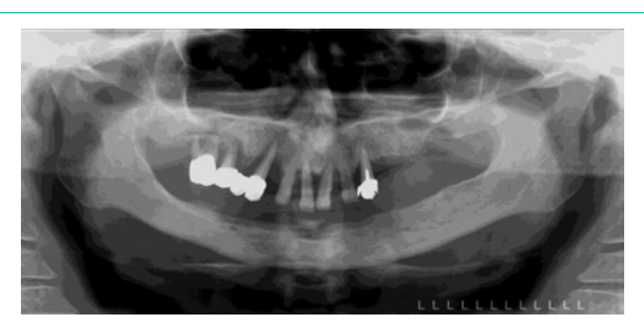
Figure 5: Initial OPG investigation.

width and 5 mm in height. The area was covered by clinically normal soft tissue without sensitivity upon palpation and did not present any history of pain while the denture was used.