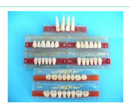
Figure 13: Extracted natural teeth and the set of artificial teeth.

Maxillary extracted teeth were used for a better choice of the artificial teeth [12, 13]. Color, shape and dimension are factors to be accounted when artificial teeth are chosen (Figure 13). Fortunately, we found an appropriate set of very small teeth in our artificial teeth collection.