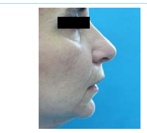
Figure 17: Post-treatment profile of the patient.