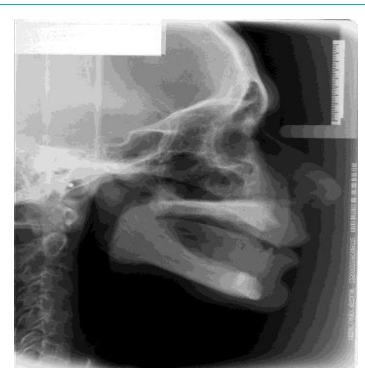
Figure 16: Post-treatment lateral radiograph.

The new complete lower denture covers the abnormal protuberance, adding significantly to the muco-osseous support of the prosthesis. Denture flanges were designed following the principle of maximum physiological extension (Figure 14, 15).