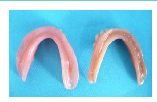
Figure 14: Comparative aspect of the old and new denture.