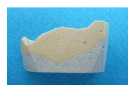
Figure 10: Section of the right mandibular edentulous ridge distal to the protuberance.