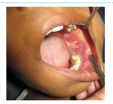
Figure 1: Ameloblastic fibroma.

In the present case, the histopathological examination with hematoxylin and eosin staining reported as a cellular lesion composed of immature mesodermal component along with islands of odontogenic epithelium and areas of dentin. No evidence of malignancy, such as nuclear pleomorphism, was found. The case was finally confirmed as ameloblastic fibro-odontoma. The lesion was excised intraorally under general anesthesia.