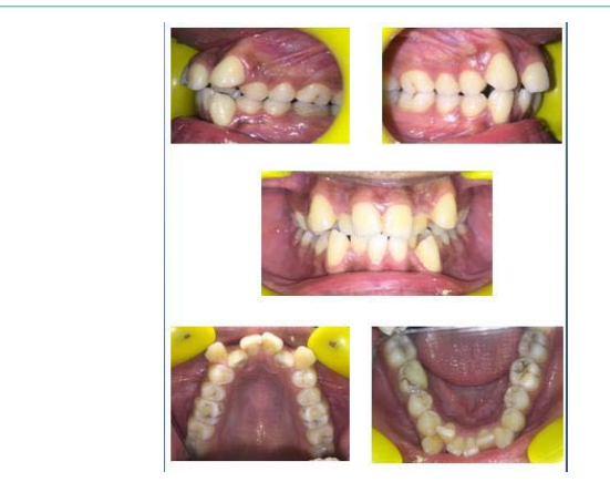
Figure 2: Pre-treatment intra-oral photographs.