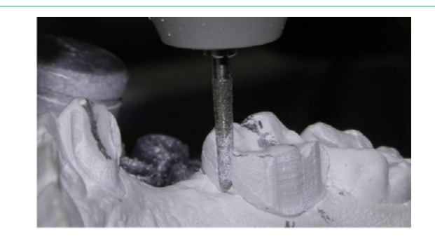
Figure 2: Diagnostic cast milled using torpedo turbine bur, same size as the one that was to be used intraorally. Zero degrees interlocks and lingual wall preparation.

J Dent & Oral Disord - Volume 4 Issue 2 - 2018 ISSN: 2572-7710 | www.austinpublishinggroup.com Smarandescu. © All rights are reserved