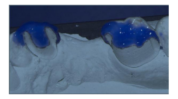
Figure 4: Resin templates made on the modified diagnostic cast.

Figure 3: Marking the margins that resulted after the preparation of the cast.