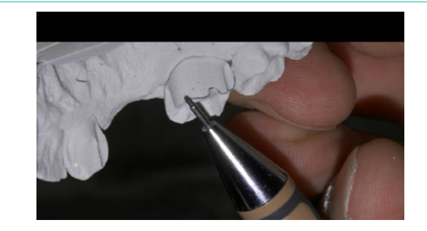
Figure 3: Marking the margins that resulted after the preparation of the cast.