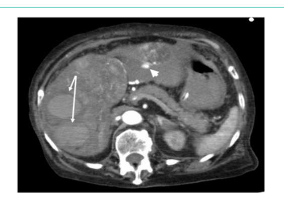
Figure 1: Contrast-enhanced computed tomography revealed widespread Hepatocellular Carcinoma (HCC) in both lobes of the liver and a rupture of the tumor in the left lobe. Arrows indicate intrahepatic hematomas and the arrowhead indicates extra hepatic hemorrhage.