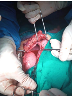
Figure 3: Surgical reduction of Hiatal Hernia and closure of Hiatal orifice.

The presence of other organs herniated along with the stomach can affect the clinical presentation, course and treatment of the hernia. For instance, if the transverse colon or small bowels are also herniated, it could cause chronic symptoms such as constipation or intermittent partial bowel obstruction. Alternatively, it may be the primary cause of acute obstruction [4,6,7], in this case, patients may present with severe epigastric pain. If the obstruction persists, ischemia, necrosis, perforation, and septic shock may occur. The presence of severe epigastric tenderness, chest pain, and dyspnea is a reason to consider a differential diagnosis of type IV PEH. Chest X-ray often identifies a PEH as retrocardiac air-fluid level in the stomach or intrathoracic bowel. Computed tomography is a useful tool to evaluate the widening of the esophageal hiatus, size, content, and position of the PEH. PEH warrants additional attention compared to the more common sliding hiatal hernia due to potentially life-threatening complications such as strangulation, necrosis, or perforation that may develop [8]. Immediate and intensive surgical intervention is crucial to prevent deterioration.