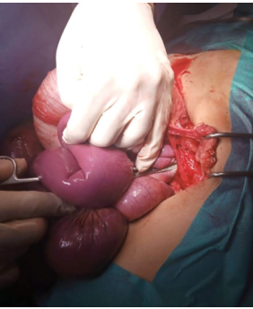
Figure 2: Image showing distension of the colon and small intestine.