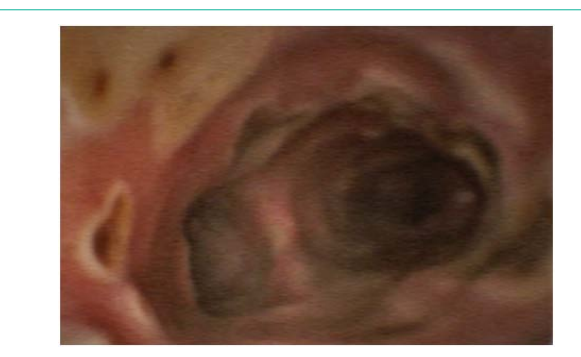
Figure 1b: After 10 days of IV antifungal therapy.