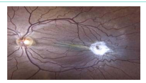
Figure 1 : Fundus examination of the left eye showed a gray-flat fibrous lesion at the macula obscuring the fovea and the perifoveal region.

Epiretinal membrane is avascular fibrous tissue, which is adhered to the internal layers of retina in the macular area. Patient may be asymptomatic or present with blurring of vision and metamorphopsia.