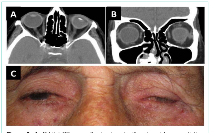
Figure 3: A. Orbital CT scan after treatment with external beam radiation therapy, showing complete tumor regression. B. Macroscopic appearance after treatment with external beam radiotherapy.

Radiation therapy can result in common cutaneous side effects, such as erythema, depigmentation, necrosis, atrophy and telangiectasia. The main ocular adverse effects are dry eye, loss of eyelashes, ectropion or entropion, cataracts, neovascular glaucoma and radiation-induced optic neuropathy and retinopathy.