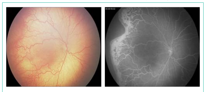
Figure 1: Plus Disease- OD.

On subsequent eye examinations, the neovascularization and plus disease resolved (Figure 2) and the patient was monitored weekly until 40 weeks gestational age, then followed every two months with examination under anesthesia and fluorescein angiography. On examination at 10 months of age, tufts of neovascularization were noted inferotemporally in the retina of both eyes (Figure 3). The