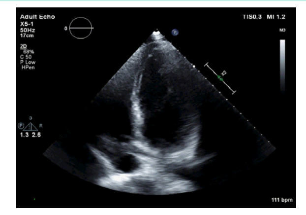
Figure 2: Transthoracic Echocardiogram.

and altered mental status [1]. Severe cases may result in elevated intracranial pressure (ICP) [1]. Rarely, cryptococcal meningitis may follow a fulminant course. Although cardiac abnormalities have not been associated with cryptococcus meningitis particularly, there are many reported cases that document a connection between elevated ICP and cardiac dysfunction [2]. Here, we report what to our knowledge is the first case of fulminant cryptococcal meningitis complicated by Takotsubo Cardiomyopathy in a 47 year old male with AIDS.