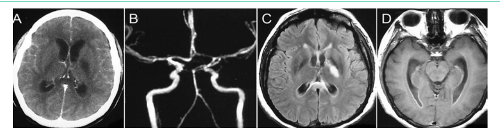
Figure 1A: Contrasted CT scan on admission shows hydrocephalus, a left capsular infarction and abnormal insular gyral enhancement. Figure 1B: MRI angiography performed 18-days after admission revealed arteritis involving both proximal MCAs and at vertebrobasilar system. Figure 1C: Axial FLAIR MRI shows hyperintensity at the left posterior limb of the internal capsule (ischemic infarction). Figure 1D: Axial T1 gadolinium-enhanced MRI disclosed dilatation and abnormal ependymal enhancement.