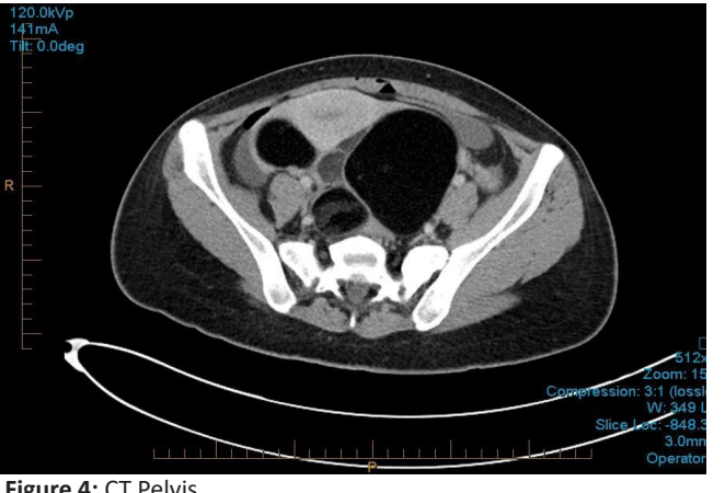
Figure 4: CT Pelvis.

Histopathology of endometrial curetting reported secretory change with Arias Stella's reaction. Serial b-HCG continued to downtrend, becoming negative 4 weeks later. Tumour markers showed Ca 125 at 87 U/ml (<35), Ca 19.9 at 131 U/ml (<35), AFP of 2.5, and a CEA of 2.6 (<0.5).