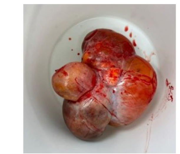
Figure 5: Surgical specimen – Dermoid cyst.

posteriorly to the midline, filling the POD and up towards the pelvic brim along the posterior abdominal wall. There was no distinguishable normal ovarian tissue. The right fallopian tube was intimately adherent and could not be separated. The Dermoid was removed without rupture (Figure 5). The uterus was normal. Two small 3x2 cm uncomplicated cysts were also identified in the left ovary. These were aspirated for cytology but otherwise left intact. Histology confirmed a mature cystic teratoma surrounded by a fallopian tube. Cytology from both cysts in the remaining left ovary was normal. The patient recovered fully. Repeat tumour markers 2 weeks later were normal.