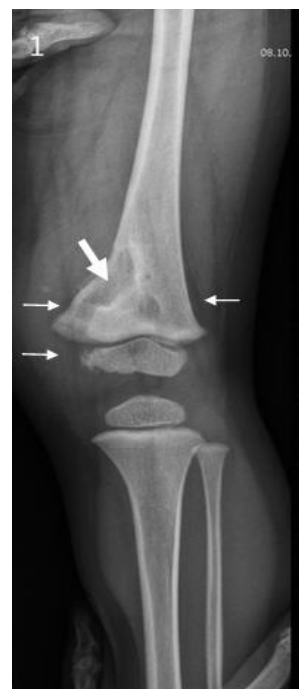
Figure 1: Osteolytic lesion at distal femoral metadiaphysis (thick arrow), with periosteal reaction and soft tissue swelling (thin arrows).

granulation tissue. Tentative diagnosis by sonographic examination was pathologic fracture of left lower femur with granulation tissue over medial aspect of left knee. Radiographic study showed lytic lesions at distal femoral metadiaphysis, with periosteal reaction and soft tissue swelling (Figure 1). Laboratory tests showed leukocytosis with normal C-reactive protein. MRI of the left knee without contrast enhancement showed; 1. a 4.2 cm multiloculated cystic lesion with extraosseous and epiphyseal extension in medial aspect of distal femoral metaphysis (Figure 2), 2. cortical erosion and bony sclerosis, 3. intact anterior and posterior cruciate ligaments and intact medial and fibular collateral ligaments, 4. no evidence of meniscal tear or joint effusion or chondromalacia patellae. Operative management by debridement and saucerization, curettage of the distal femur and left long leg splint were done. Acid Fast (AFB) stain and TB culture of the bony tissue specimen were performed and were also sent to CDC. Results revealed the etiology of osteomyelitis was due to Mycobacterium bovis , which was proved to be BCG related. No TB contact history noted. Histopathology of bony tissue specimen revealed chronic granulomatous inflammation with foci of necrosis and multinucleated giant cells suggestive of Langhans' giant cells; no fungal or mycobacterial microorganisms are seen on PAS, GMS and