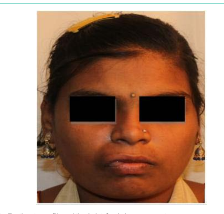
Figure 1: Patient profile with right facial asymmetry.

A 16 year old female patient came to the Department of Oral Medicine and Radiology with complains of pain in relation to the upper right back teeth region since three months. Patient was apparently normal one-year back then she noticed growth, it was small in size and progressive to present size. She had history of pain while chewing and during brushing and also bleeding on touch. Patient had undergone treatment for the same since one-year back and they excised the lesion completely. On extraoral examination reveals Gross asymmetry noted. Swelling seen over of size approximately 2°1.5 cm extending superiorly from right ala of the nose to the upper lip and mediolaterally from the midline to the corner of the lip. Extension of