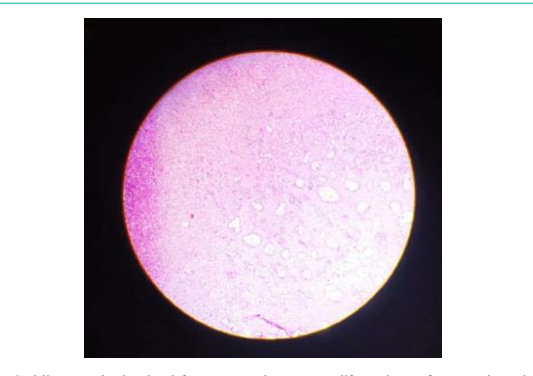
Figure 4: Histopathological features shows proliferation of vascular channel with ulcerated area under 40x.

inflammatory hyperplasia (clinical fibroma, epulis fissuratum, and pulp polyp), palatal papillary hyperplasia, giant cell granuloma, pregnancy epulis and Pyogenic granuloma [1]. Pyogenic granuloma is a common tumor-like growth of the oral cavity or skin that is considered to be non-neoplastic in nature [5]. Hullihen's description in 1844 was most likely the first Pyogenic granuloma reported in English literature, but the term "pyogenic granuloma" or "granuloma pyogenicum" was introduced by Hartzell [6] in 1904. Although it is a common disease in the skin, it is extremely rare in the gastrointestinal tract, except for the oral cavity where it is often found on keratinized tissue. There are two kinds of Pyogenic granuloma namely Lobular Capillary Hemangioma (LCH type) and non-LCH type, which differ in their histological features [7].