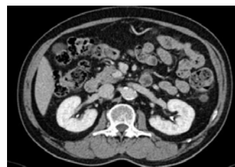
Figure 1: Hypervascular mass.

A 68-year-old man presented to our hospital for the evaluation of an incidentally detected pancreatic mass. Serum tumor marker levels were within normal limits. On delayed-phase computed tomography, a homogeneous enhancing 1.8 cm-sized hypervascular mass was detected in the pancreatic head (Figure 1). As the radiologic impression was that of a neuroendocrine tumor, the patient underwent pylorus-