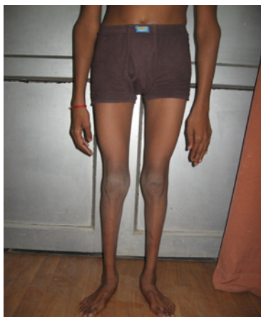
Figure 1: Photograph of patient showing symmetrical distal wasting of extremities.

delayed distal latencies, decreased CMAPs and uniform slowing of conduction velocities with non recordable F waves in all tested nerves suggestive of demyelinating and axonal affection of lower limbs more than upper limbs. SNAPs were non recordable in all tested nerves on routine NCS. VEP study was normal. MRI brain was normal. MRI spine showed diffuse atrophy of thoracic spinal cord.