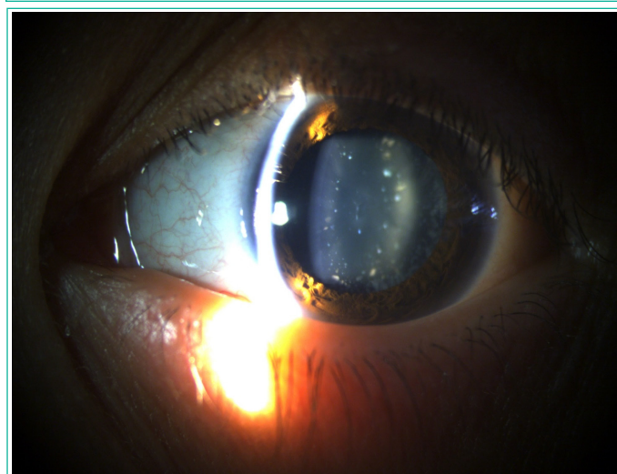
Figure 2: Blue dot cataract of left eye.