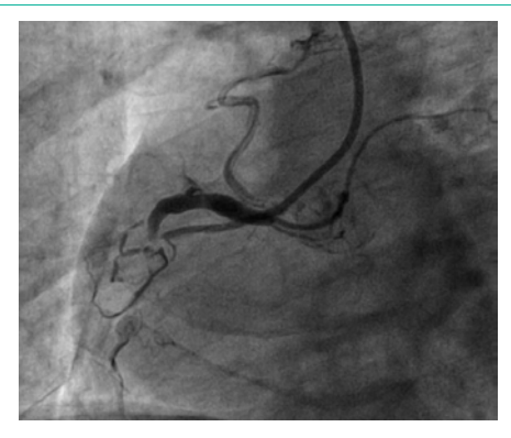
Figure 1: Right Coronary Artery (RCA) with total thrombotic occlusion in the proximal-middle segment with an abnormal vessel directed towards the aorta.

There is no consensus as to the indications for surgical or endovascular correction of coronary fistulas, the recommendation is to individualize in each case. The therapeutic decision should focus on the evaluation of the hemodynamic repercussion and