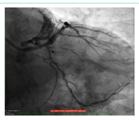
Figure 2: Left coronary artery with proximal ectasia, multivessel disease and emergence of great caliber vessel directed towards the aorta.