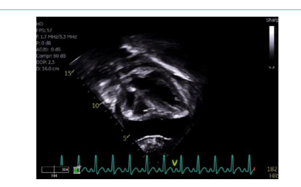
Figure 2: Pericardial Effusion.