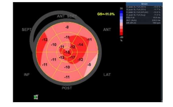
Figure 3: Left ventricular systolic function.