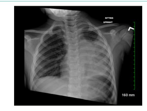
Figure 1: Chest X-Ray prior to pericardiocentesis.

She was intubated and placed on a mechanical ventilator, received fluid resuscitation and inotropic support. In addition to lung findings, a chest X ray was concerning for enlargement of the cardiac silhouette (Figure 1) and therefore an echocardiogram was requested which showed a large pericardial effusion (Figure 2) with clinical tamponade and (Figure 3) moderately to severe decreased left ventricular systolic function with a large circumferential effusion, largest pocket measuring ~22mm. There was partial right atrial collapse. Pericardiocentesis was performed emergently and 160ml approximately of yellow serous fluid were drained (Figure 4). Hemodynamic condition and LV function by echocardiography