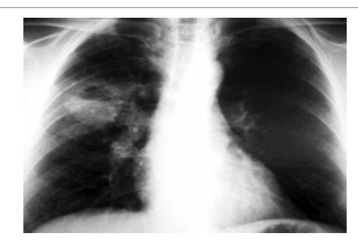
Figure 1: Chest X-ray (2 weeks after injury) showing cavity water gas level average level in the right lung field.

There had clubbing, lymph nodes or rashes. The findings from the lungs and neck were normal. Was computed tomography (Figure 2) which showed the following: "Presence Round soft tissue mass in the posterior part of the right upper lung lobe diameter about 3,5cm with a relatively fuzzy boundaries and infiltration of the proximal pulmonary parenchyma. After intravenous administration of soluble contrast media observed peripheral enhancement of the structure with non-enriched core content that has local low densities, indicative of degeneration hydric central mass. Mild peripheral filtration extend to the pleural thickening with localized pleural locally. Small bronchial lymph nodes swollen right, without other glands in the mediastinum. No pleural reaction or fluid collection. "The patient underwent fiber vrochoskopisi who showed erythema, edema of the mucosa