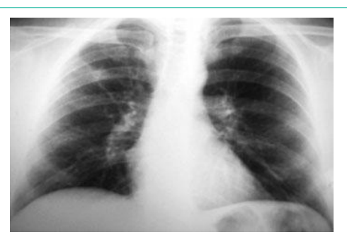
Figure 3: Normal chest radiograph 3 weeks after initiation of therapy.

much cough or expectoration and had no back hemoptysis. At retesting after antibiotic treatment, the chest radiograph showed reduction in size of the cavity. The blood count showed 6100 white and 420,000 platelets with normal hemoglobin and hematocrit. Three weeks later the chest radiograph was normal (Figure 3), and the patient was completely well.