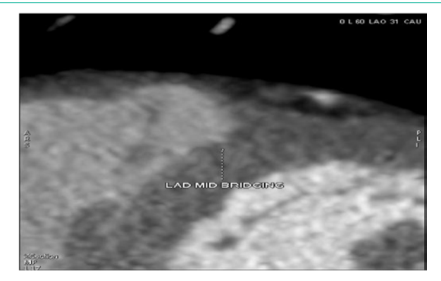
Figure 3: Low-dose coronary CT angiography showing end on view of mid-LAD with myocardial bridging.

The pathophysiology of troponin in exercise has long been an area of interest [3] especially in intensive sports such as marathon running. Prior to the introduction of hs-cTn, studies of troponin release in lower intensity exercise have been hampered by the detection limit of troponin assays. In a recent study using the same Abbott hs-cTnI assay Rosjo et al [9] detected increases in serum hscTnI after exercise stress testing. Subjects with reversible ischemia (n=19) showed a 50% increase in median hs-cTnI from 4.4ng/L to 6.9ng/L (p < 0.01) 4.5 hours after the exercise stress test. Median hs-cTnI also rose from 2.5ng/L to 5.1ng/L in subjects (n=179) without reversible ischemia. In this case, report the patient's baseline troponin (6.4ng/L) was above the 99th percentile URL for healthy young women with a mean age of 35 years in Singapore (4.8ng/L) [4] using the same assay. Applying the all-group URL (25.6ng/L) [1] or female URL (17.9ng/L) [1] for the Abbott assay would have masked the fact that our patient's baseline hs-cTnI was significantly elevated and there was a 62.5% increase in the post-exercise troponin level to 10.4ng/L. From studies on biological variation in healthy subjects and those with stable coronary heart disease, the reference change value