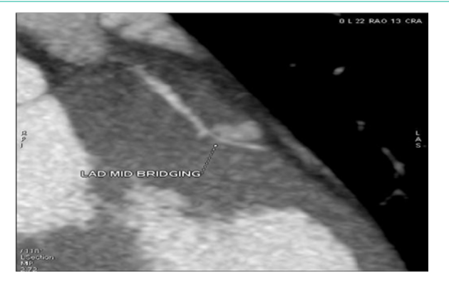
Figure 2: Low-dose coronary CT angiography showing profile view of mid-LAD with myocardial bridging.

increased use of CCTA for evaluation of cardiac risk and triage of chest pain in the emergency department the incidence of MB can only rise. The real magnitude of MB is unknown although an incidence of over 50% has been found in autopsy series [6]. MB may be more common than generally appreciated; a prevalence of over 50% in Asians has been reported [7]. While MB is generally benign [6] it can be associated with catastrophic cardiac outcomes [6,8].