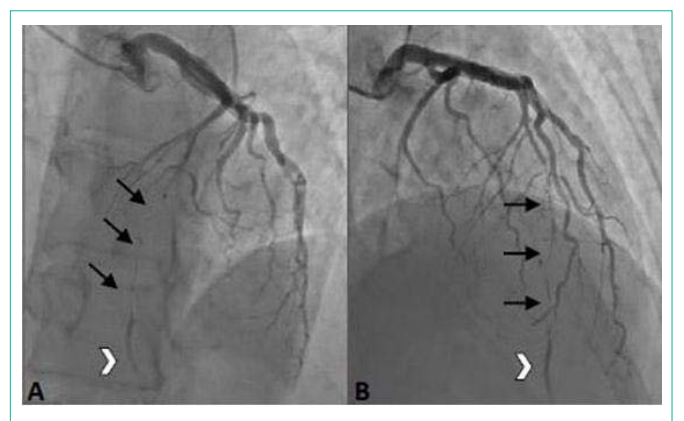
Figure 1: Coronary angiography findings. Cranial left anterior (A) and right anterior (B) oblique angiographic projections showing amid-to-distal subocclusive LAD dissection (black arrows) with distal dye stasis (arrowhead). LAD: left anterior descending coronary artery.