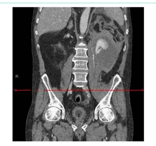
Figure 3: CT-scan Extensive retro-peritoneal hematoma and hemorrhage (red arrow).

inflammatory response that can generally induce bleeding [19]. For example, patients with dengue produce antibodies against the virus activating plasminogen and fibrinolysis, contributing to the bleeding. In contrast, SARS-CoV-2 can cause hyperfibrinolysis without any significant bleeding [20].