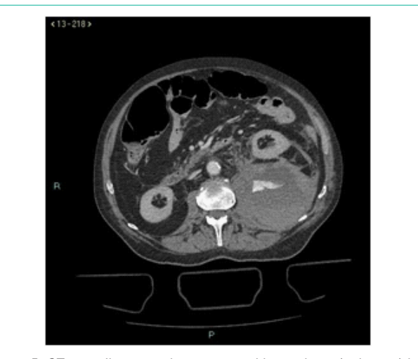
Figure 5: CT scan: lleo-psoas hematoma and hemorrhage (red arrow) in a COVID-19 patient.

receive prophylactic anticoagulation [28]. In these cases, the possible explanation of devastating cerebral events can be hypoxemia [29]. Another reason can be the development of antiphospholipid antibodies [30]. Severe hypertension and endothelial dysfunction may be another frequent cause of this phenomenon [31]. But, a frequent finding in COVID-19 patients is iliopsoas hematoma. It consists in a retroperitoneal hemorrhage involving the iliopsoas muscle (Figure 5) [32]. Some predisposing factors can be responsible for this event, such as supra-prophylactic doses of anticoagulants, advanced age, and contemporary hemodialysis [33]. Separately may be considered the COVID-19 patients suffering from non-valvular atrial fibrillation and so treated with Direct Oral Anticoagulants (DOACs). But, DOACs resulted superior to Vitamin K Anticoagulants (VKACs) because of lower risk of intracranial hemorrhages [33]. Similarly, these drugs were non-inferior to conventional anticoagulants (VKACs) in term of efficacy, inducing less bleeding in a broad spectrum[34-37].