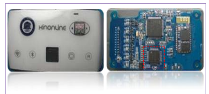
Figure 2: One turn-key solution using the AFE chipset (red box in the right figure), this configuration is for a Holter device and the experimental results suggested the approval of industry standard, regulated by the CFDA (China Food and Drug Administration, equivalent to the FDA in USA).

Austin J Biomed Eng - Volume 1 Issue 3 - 2014 ISSN : 2381-9081 | www.austinpublishinggroup.com Wang et al. © All rights are reserved